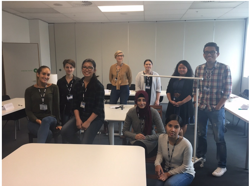
The newest additions to the CSC family.